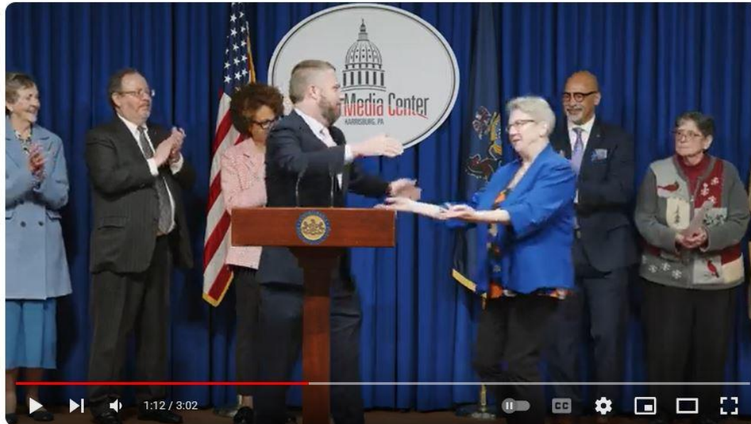
Waxman Lauds Advancement of Anti-Death Penalty Bill