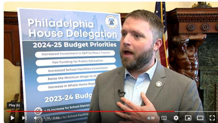
Waxman: Public Transit is a Key Budget Priority